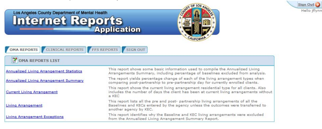
Copyright © 2009 Department of Mental Health. All rights reserved.

Click on the Report Name you wish to run.